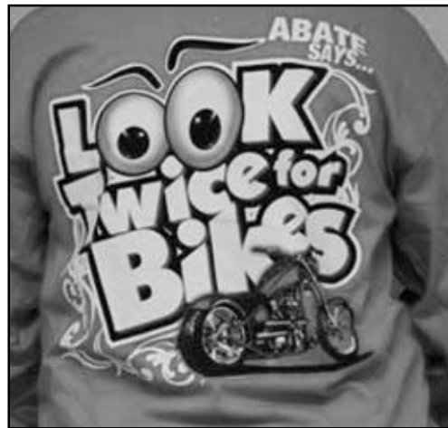
Short Sleeve, $12; Long Sleeve $18 Hoodies, $30, several colors