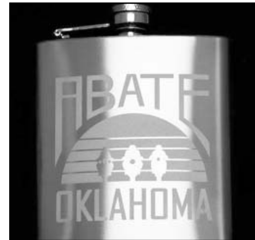
6 oz Stainless Steel Flask, $15 8 oz Stainless Steel Flask, $18