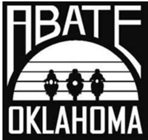
Vinyl Window Decal, your choice of three colors, 3" square